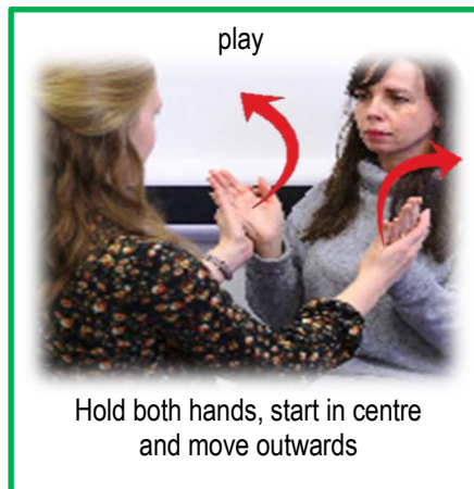
Hold both hands, start in centre and move outwards