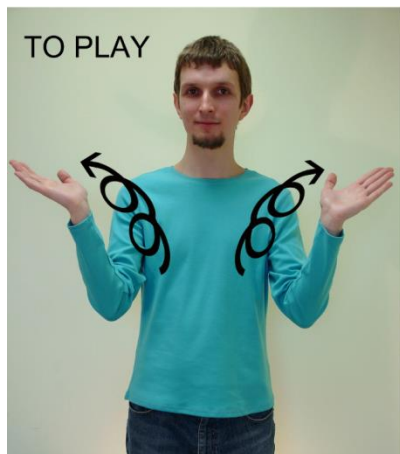
With palms of both hands upwards, arms spiral upwards and outwards.