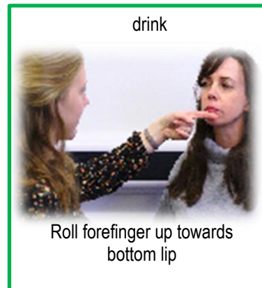
Roll forefinger up towards bottom lip